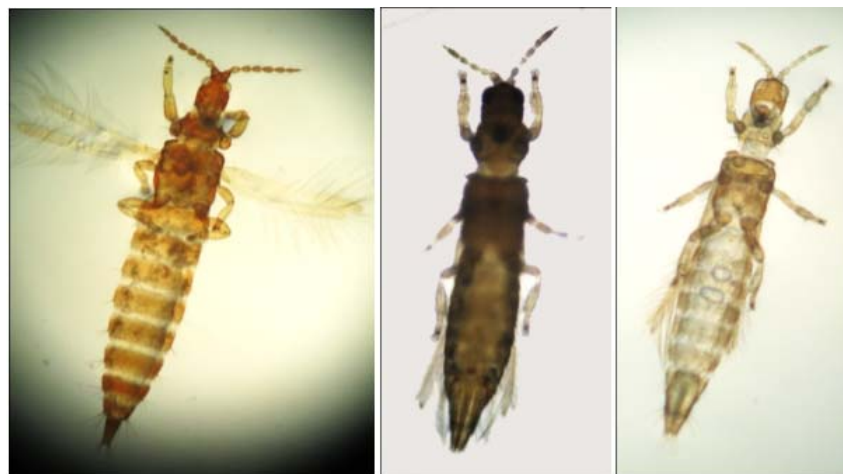
C) H. tenuipennis Bagnall