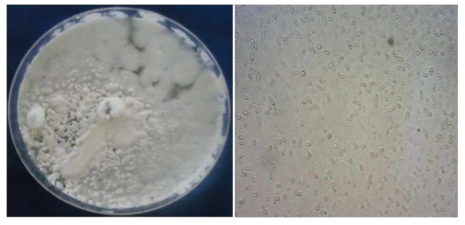
Plate 1a: Culture Plate of B. bassiana

The B. bassiana isolates at first appeared as white colour, later becoming yellowish and powdery type. Spore structure were characterized viz. , spherical or oval and non septate (Plate 1a and 1b). The pathogenicity of B. bassiana was proved by artificially inoculated the pathogen to healthy silkworm under in vitro conditions showed the typical symptoms of white muscardine disease and also re-isolation of pathogen from diseased silkworms were similar to that of primary culture.