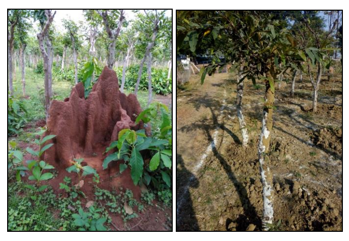
Fig 1: Termite mound and their infested plant in the block plantation of T. arjuna .

between the blocks (P=0.013). Nearly, 60% and 70% of the infested plants were young at Kota and Pendari, respectively. But, the differences between young and old plants was significant at Kota (P=0.01) and non-significant at Pendari (Fig. 3).