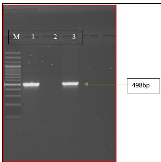
Fig 2: AMOS PCR for identification of Brucella species Lane 1: positive control ( B. abortus S99); Lane 2: negative control; Lane 3: Brucella culture DNA and Lane M: 100 bp ladder