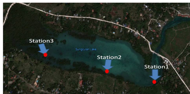
Fig 1: Songculan Lagoon

Three stations were selected, station 1- one near the mouth (9° 38'9" N, 123°50'18" E), station 2- in the middle (9°38'8" N, 123°50'13" E) and station 3-the other one in the end (9°38'5" N, 123°50'7" E) of Songculan Lagoon in Songculan, Daus, Bohol Philippines with dense mangrove populations on the edges.