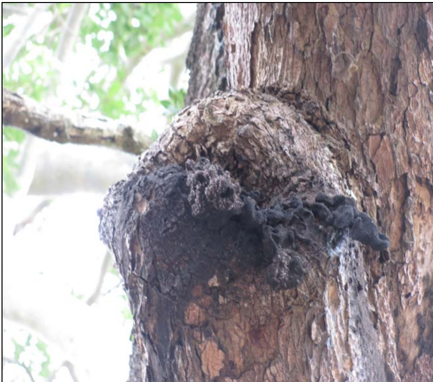
Fig 2: Arboreal nest on tree