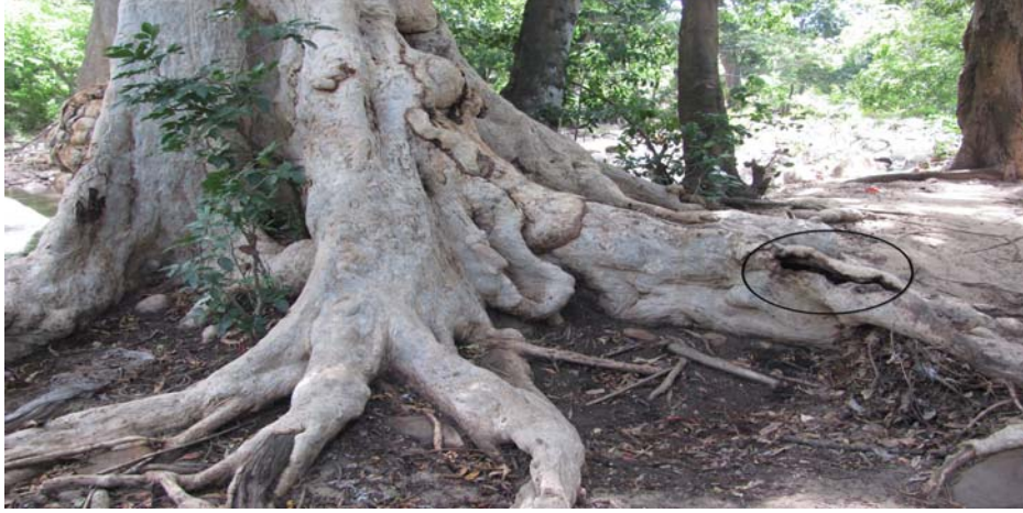
Fig 5: Nest inside the crevice at tree base

The nest first sighted in April, 2012 at Champakkad, Chinnar which led to our detailed study was an abandoned one and was found attached to a man-made rocky structure, the 'Dolmen', or the postal tomb. Usually the nests are seen on tree trunks, branches or roots. This has been the first documentation of a Hospitalitermes nest on an inanimate substrate.