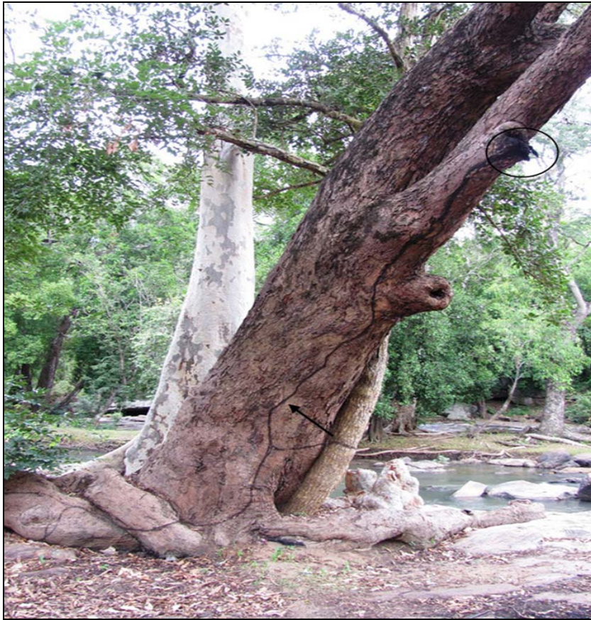
Fig 1: Processional black trails on trees