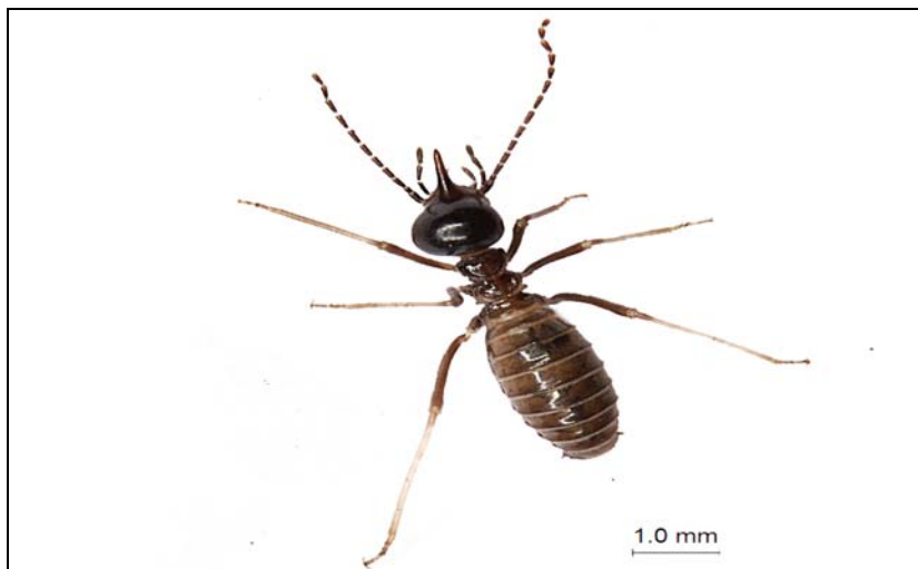
Fig 4: H. monoceros –soldier caste (dorsal view)

soldiers who were initially unaware about the ant intrusion were soon agile, but only after being bounded by a few workers. This triggered a conspicuous side to side oscillatory movement of the soldiers, ultimately driving away the ants out of the column, probably by squirting the terpene secretions from the nasus. This documented instance proves that apt positioning of the soldiers is crucial in wading away their enemies.