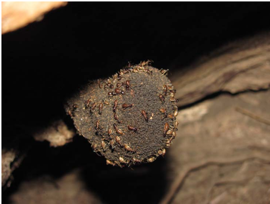
Fig 6: Nest building in progress