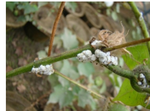
Cotton branch infested by M. hirsutus