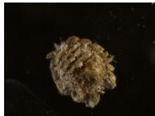
Rastrococcus iceryoides (Green)