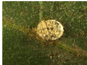
Maconellicoccus hirsutus (Green)