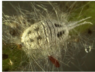
Ferrisia virgata (Cockerell)