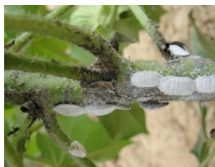
Cotton stem infested by P. tamarindus