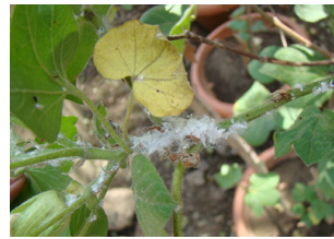
Cotton plant infested by F. virgata