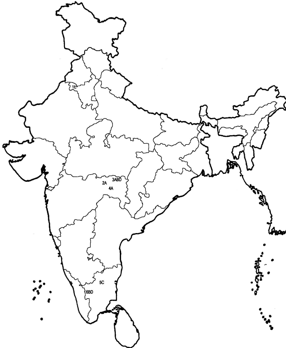
Fig 1: Distribution of five mealybug species as minor pests of cotton in India

Numbers in the map (in parenthesis) indicate sites Haryana: Sirsa (1), Maharashtra: Amaravati (2), Nagpur (3), Wardha (4), Tamil Nadu: Salem (5), Coimbatore (6).