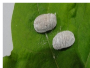
Perissopneumon tamarindus (Green)