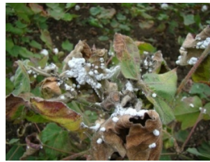
Cotton plant infested by N. viridis