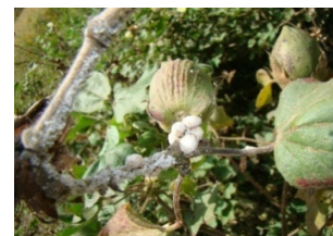
Cotton branch and boll infested by R. iceryoides