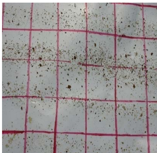
Plate III: Sticky paper divided into Squares for easy counting