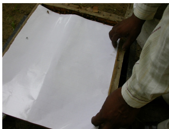
Plate II: Method of Placing Sticky paper on Bottom board