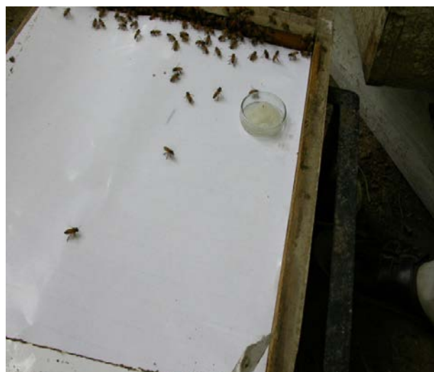
Plate IV: Oxalic acid (Wick method)