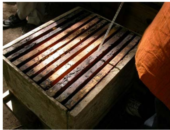
Plate VI: Oxalic acid (Top Bar method)