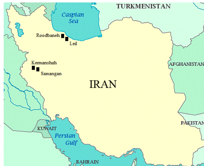
Fig 1: Map of Iran depicting the sampling sites