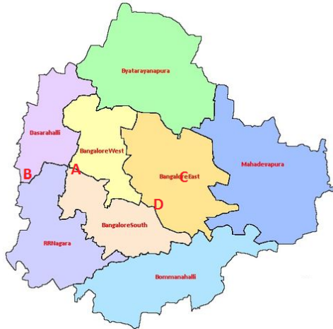
Fig 1: Distribution of collection points in Bangalore.

Four sites of the Bangalore were selected for sampling based on the following criteria: Accessibility, diversity of vegetation and soil characteristics, degree of exposure to human activities, and geographical position on the land. To draw inferences on the relationship between the diversity of communities and anthropogenic activities, the sampling covered virtually all types of habitat on the land (Figure 1). Human impact on collecting sites was categorized as low, intermediate, or high, based on the frequency of area usage, access and presence of buildings, economic activities, and number of tourists. The following are the four sites. (A) Semi Urban Region, (SUR) (B) Bangalore Rural, (BR) (C) Bangalore Urban (BU) and (D) Rajaji Nagar Industrial Area (RIA). Spiders were sampled from August 2013 to March 2014, covering the rainy and winter seasons.