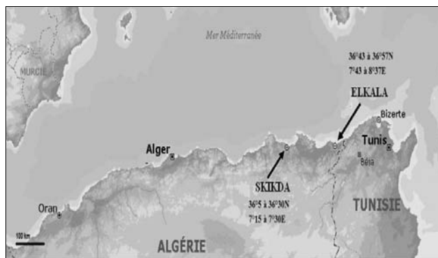
Fig 1: Location of the different sampling sites along the east Algerian coast: El-Kala and Skikda.

Sampling sites were chosen because of their geographical locations in eastern Algeria (Figure 1). Site selection was based on the level of pollution as well as ease of access to the study area and abundance of species. El-Kala (36°53'44" N; 08°26'35" E) is close to the Tunisian border (10 km). This site is part of a national park and is not urbanized, therefore, it was considered as the healthy reference site. And Skikda (36°45'0" N; 06°49'60" E) is located about 180 km from the Tunisian border. This site is near from Stora port that is characterized by an intense maritime traffic. This site is also polluted by PAH because of the presence of an important petrochemical complex and human activities.