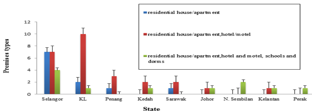
Fig.2: Premises types treated by pest control companies in Malaysia

Figure 3 according to their states respectively. According to the analysis survey data, residential houses, apartments, hotels and motels have the highest infestation of bed bugs especially in Kuala Lumpur and Selangor. Treatment method preferred by most pest companies in Malaysia was chemical and spray rather than clean up and combination (Figure 3).