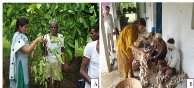
Fig 2: Collection of Antheraea mylitta Drury, Daba TV cocoons at A Mahadevpur, Telangana and B. Bhandara (Maharashtra).

The rearing of Tasar ecoraces was done by taking proper measures of disinfection to prevent outbreak of diseases and any attack by predators in fields. The quality of cocoons depends upon the selection of rearing site and food plants, optimum temperature and relative humidity, brushing, removal of dead and diseased worms, supervision and maintenance of larvae and other rearing operations like pruning, weeding out, watering etc., If any of these operations are infective, it seriously affects the yield.