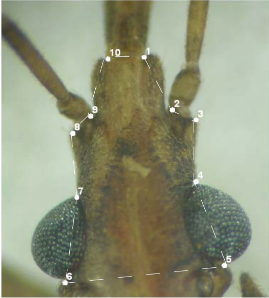
Fig 1: Head of Psammolestes arthuri showing the landmarks (1-10) disposition. The polygon enclosed by the points conform the configurations analyzed.

landmarks (LM1-LM10), all according Bookstein [12] type I and II criteria (Figure 1): 1) Interception between the anteclypeous and postclypeous, 2) internal region of antennal tubercle, 3) external region of antennal tubercle, 4) preocular, 5) postocular, 6) postocular, 7) preocular, 8) external region of the antennal tubercle (left side), 9) internal region of antennal tubercle (left side) and 10) interception between the anteclypeous and postclypeous (left side).