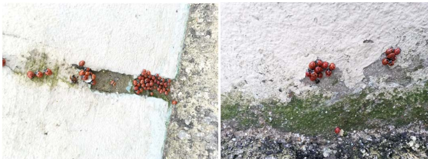
Fig 1: Coccinella septempunctata

Coccinellids in cotton fields appeared in the spring with the emergence of cowpea aphids on plants. Maximum number of lady beetles found on cotton in mid-May, when the cotton aphid moved to cotton. During hot periods when reproduction of aphids on cotton was depressed, the coccinellids and other aphidophags migrated to other plants, where at that time there were aphids (from 10 July to 25 August) occur. Starting from the end of August the number of coccinellids in the cotton fields was increased, provoked by increasing numbers of aphid and cotton bollworm eggs on plants.