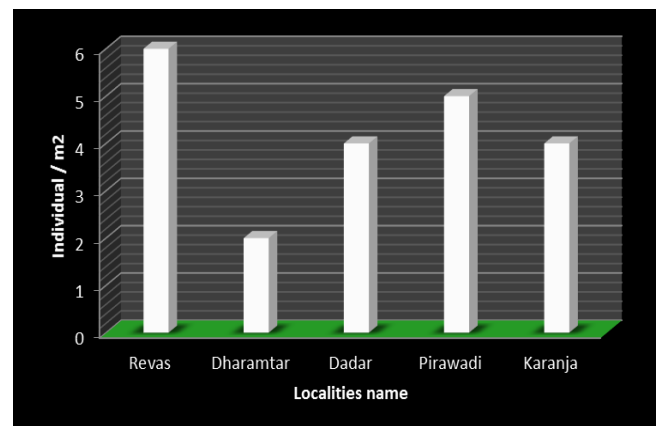
Fig 1: Bivalve species according to localities on the coast of Raigad district.