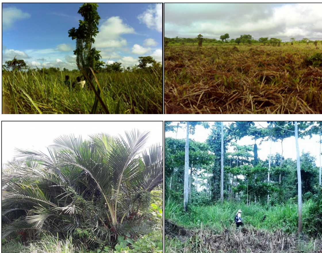
Fig 1: Sampling habitats in Agusan Marsh (clockwise: sedge-dominated swamp; disturbed sedge-dominated swamp; Terminalia Forest; Sago Forest).

Insects in habitats with shallow water were collected using a dip net. The net was dipped and swept below the water surface to collect swimming insects. Aquatic insects that cling on debris found in water were washed off the debris and collected in plastic containers. For insects dwelling on the bottom of the water or in the sediment (eg. water scavenger beetles), the dip net was swept over the water bottom. The specimens were placed in labeled plastic jars containing tap water. These were sorted immediately in the laboratory to facilitate collection of insects from smaller debris, and transferred to small plastic jars with cap containing 80% ethyl alcohol. These were then classified based on morphological feature and placed in microvials containing 80% ethyl alcohol for later identification.