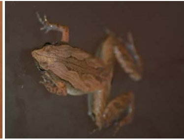
Fig 3.12: Microhyla ornate