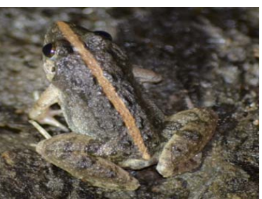
Fig 3.7: Fejervarya limnocharis