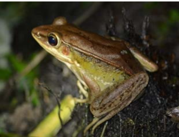
Fig 3.8: Humerana humeralis