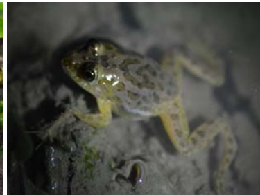
Fig 3.3: Euphlyctis cyanophlyctis