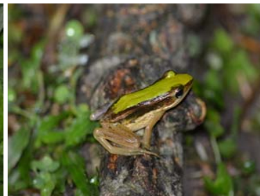
Fig 3.6: Hylarana taipehensis