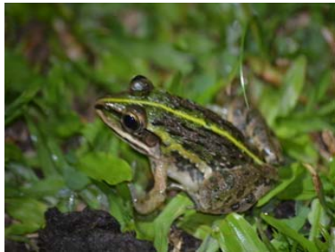
Fig 3.9: Fejervarya pierrei