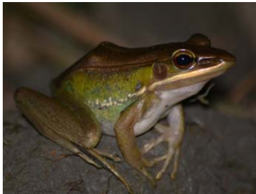
Fig 3.1: Clinotarsus alticola