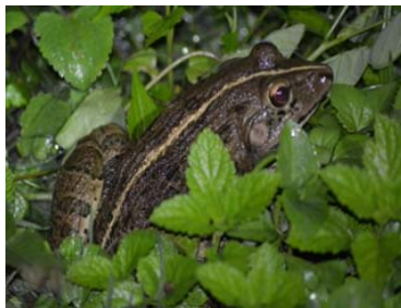
Fig 3.5: Hoplobatrachus tigerinus