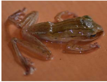
Fig 3.11: Chiromantis simus