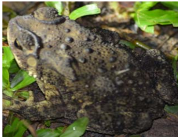
Fig 3.2: Duttaphrynus melanostictus