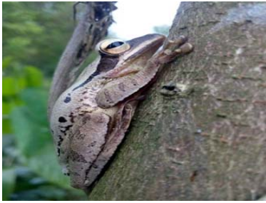
Fig 3.10: Polypedates leucomystax