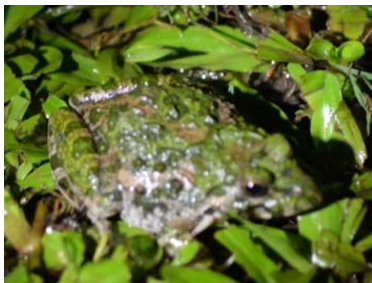
Fig 3.4: Hoplobatrachus crassus