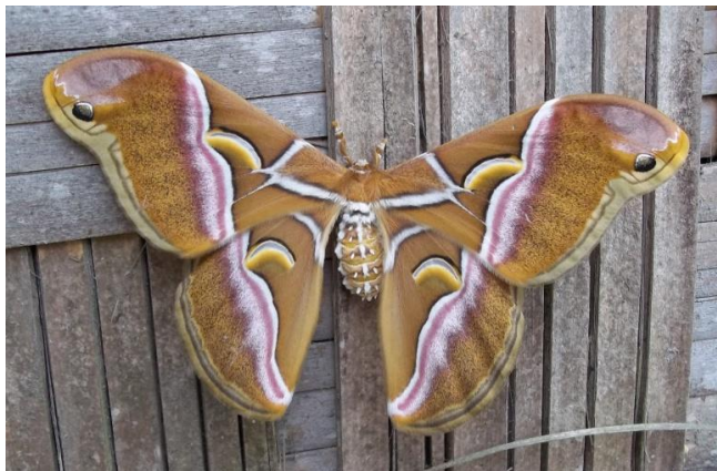
Plate 5: ♀ Samia canningi