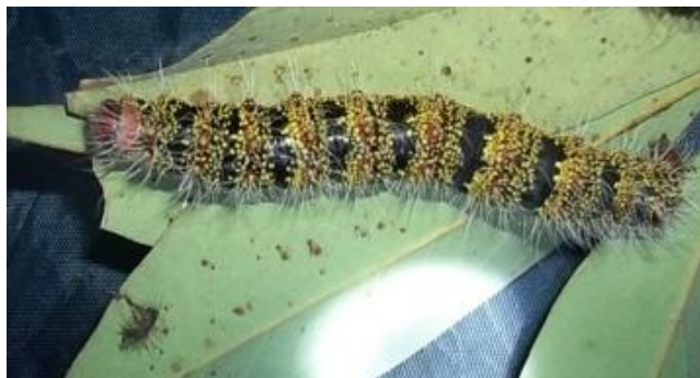
Plate 13: Larva of Cricula trifenestrata

Plate: Wild sericigenous insects of Hoollongapar Gibbon Sanctuary, Jorhat, Assam