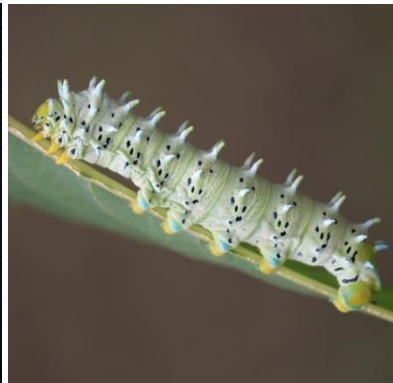
Plate 12: Larva of Samia canningi