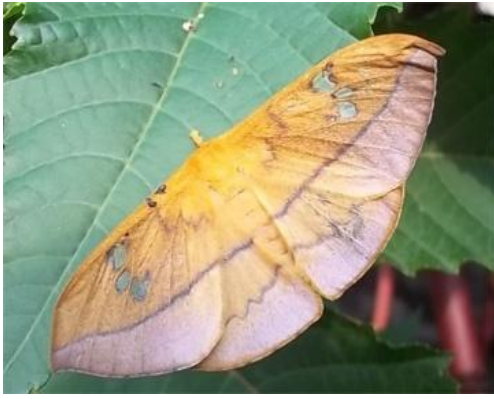
Plate 1: ♀ Cricula trifenestrata