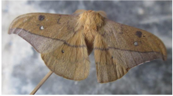
Plate 2: ♂ Cricula trifenestrata