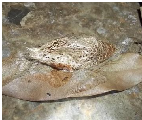
Plate 10: Cocoon of Cricula trifenestrata