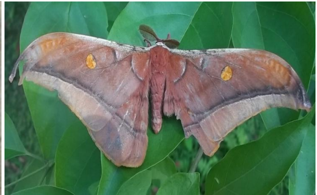
Plate 4: ♂ Antheraea assamensis