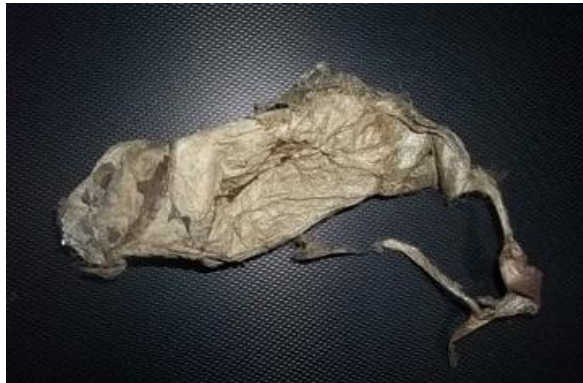
Plate 11: Cocoon of Attacus atlas