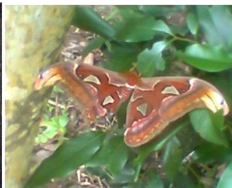
Plate 8: Attacus atlas