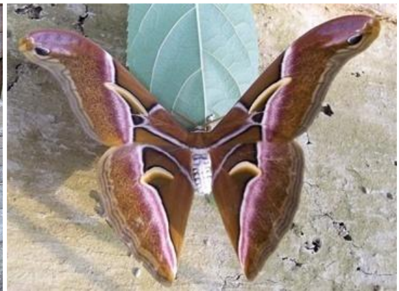
Plate 6: ♂ Samia canningi