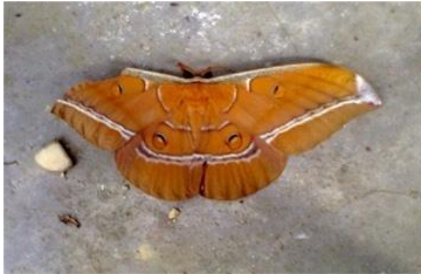
Plate 3: ♀ Antheraea assamensis