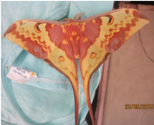
Plate 9: ♂ Actias maenas