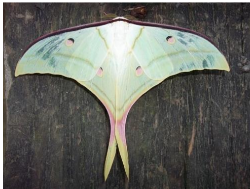
Plate 7: ♂ Actias selene