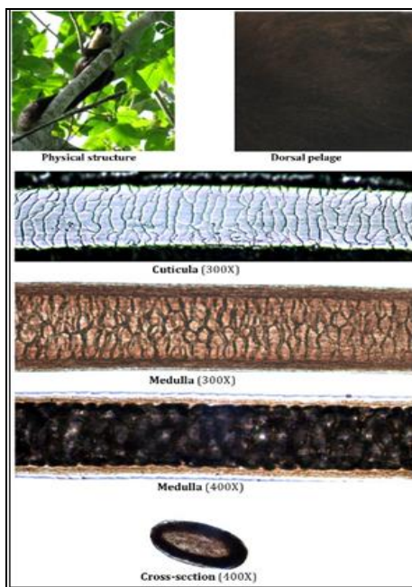
Fig 1: Photo-micrograph of hairs of black giant squirrel R. bicolor