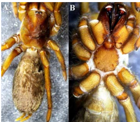
Fig 2: A. Dorsal view of cephalothorax and abdomen; B. Ventral view of sternum, labium, maxillae and abdomen.

Legs: formula 4123, prograde; leg and palp measurements: Palp 9.4[3.39, 2.07, 2.81, -, 1.13], I 12.56 [4.04, 2.36, 2.57,