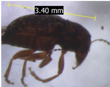
Fig 8: Adult of coffee bean weevil, A. fasciculatus

contain more moisture percentage which may be the reason for more infestation of this beetle to the stored nuts. The adult beetle is small (3-4 mm) in size with a humped body outline and long legs (Fig. 8). The dorsal side is interspersed with dark and light brown and the antennae are long with a three-segmented club. Both adult and grub damage the nuts by making holes of 1.5-2.5 mm diameter.