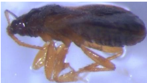
Fig 5: Predatory bug X. flavipes