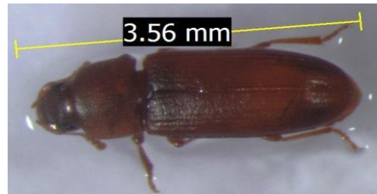
Fig 10: Adult of red flour beetle, T. castaneum .

Freshly stored nuts with less than one year period was more infested by this insect pest. Adults are a small reddish brown beetle and are about 3-4 mm long (Fig. 10). Out of total samples collected only one sample was infested by this beetle. This pest is considered as generalist feeder and damage is not readily attributable to this pest. They feed and breed on broken pieces of arecanut and imparts to a pungent odour to the commodity.