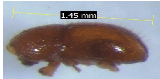
Fig 9: Adult of Palm seed borer C. carpophagus

Maximum infestation of this pest is recorded from freshly stored nuts and patora grade. The adult beetle is minute 1.2 to 2.5 mm in length and reddish brown in colour (Fig. 9). The frons is convergently aciculate with sparse, hair-like processes. Damage is caused mainly by the adult beetles which bore into the nuts and feed on internal contents. In samples with 100 % infestation with this insect were recorded.