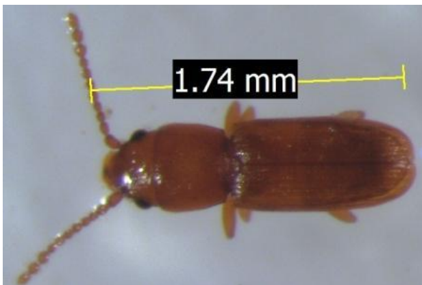
Fig 4: Adult of Flat grain beetle, C. pusillus

This pest is recorded from almost all samples collected irrespective of grade or storage period. Adults of this species are flattened, small (1.5 to 2.0 mm) in size, reddish brown in colour with long bead-like antennae (Fig. 4). It is cosmopolitan and is one the common insect pests of stored grain. Damage is usually restricted to stored product under high moisture conditions or relative humidity area. Both larvae and adults feed on stored nuts by boring inside. This insect also responsible for spreading fungal infection across the godowns. Predatory anthocorid bug Xylocoris flavipes (Fig. 5) feeding on different stages of Cryptolestes pusillus was also collected during survey.