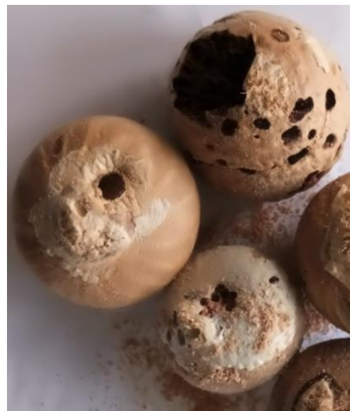
Fig 1: Arecanut sample infested by storage insect pests.

All of the insects recorded during survey damage the nuts by drilling holes into them followed by feeding and pulverising the nuts (Fig. 1). In case of heavy infestation some portion of nuts converted into fine powdered dust. All stages of insects were recorded inside the infested nuts. Highest percent incidence of storage insect pests was recorded in patora followed by fresh nuts, single chole and double chole (Fig. 2). The probable reason for this pattern of infestation may be availability of cracks on patora leads to enhance oviposition and multiplication of storage pests. Highest incidence of flat grain beetle C. pusilis with 58.30 percent population was recorded during the study. Trend of other insect species are depicted in Fig. 3.