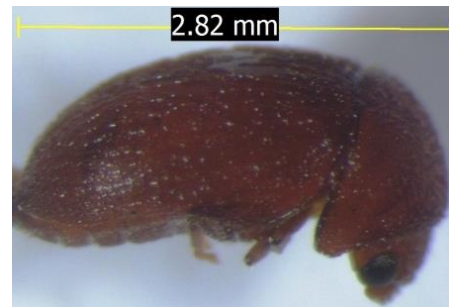
Fig 6: Adult of Cigarette Beetle, L. serricorne

Although this pest is recorded from samples belongs to all grades but severe infestation were observed in single chole and patora grade, on the basis of adult collected from respective grades. Adult of this insect is small (2 to 3.5 mm long), reddish brown and oval in shape (Fig. 6). Larvae are white with numerous long hairs (Fig. 7). Larvae feed directly on nuts and in severe infestation nuts can be pulverised. Infestation of this pest can be detected by noticing larval cocoons, frass (excrement) and dead adult beetles in stored commodity.