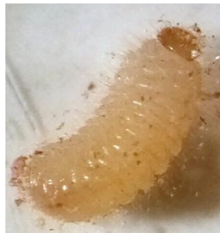
Fig 7: Larva of Cigarette Beetle, L. serricorne