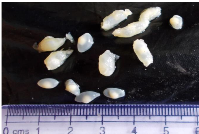
Fig 3: Cysts of Cysticercus cellulosae collected from tissue samples