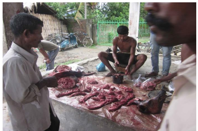
Fig 1: Selling of Cysticercus cellulosae infected pig carcass in a local market of Sivasagar district

The prevalence of porcine cysticercosis is either under estimated due to poor efficiency of visual meat inspection or overestimated through misdiagnosis of other morphological alterations in affected muscles, as the meat safety system is based only on conventional post-mortem inspection at slaughterhouse. Therefore, molecular diagnostics have been considered for validation of macroscopic diagnosis of ambiguous lesions as these tests were reported to be highly specific and sensitive [19-21]. Identification of T. solium cysticerci from the infected pig carcasses and suspected carcasses was based on amplification of large subunit rRNA gene (TBR) gene with a product size of 286 bp. All the positive cases show positive amplification of TRB gene. Dalmaso et al. [22] extracted DNA from degenerated and calcified cysts/lesions and found positive amplification for TRB gene. Lino Junior [23] also reported the importance of PCR test with TBR primers as a reliable method for detection of cysticerci in tissues from human autopsies that are in advanced evolutive stages.