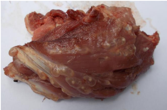
Fig 2: Cysts of Cysticercus cellulosae in skeletal muscle of thoracic region of pig carcass