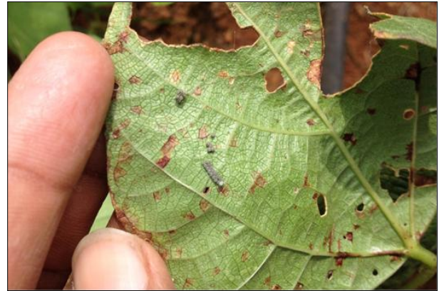
Plate 1a: Riptortus pedestris egg mass

The data pertains to the mean population of leaf footed bug was collected from the germination to harvest stage of Indian bean with respect to standard meteorological weeks during kharif 2015-16 and 2016-17 were presented in table 3.1 and 3.2 (Figure 3.1)