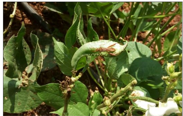
Plate 1b: Riptortus pedestris adult feeding on pods Plate 1: Riptortus pedestris incidence in field bean