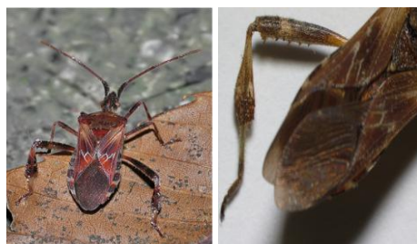
Fig 1: Adult of Leptoglossus occidentalis Heidemann. Left: specimen from Italy Right: specimen from Elazığ: posterior leg with typical expansion on hind tibia.

L. occidentalis is usually specialized on conifers and shows widespread distribution on Pinus nigra , Pinus pinea , Pinus radiata and Abies concolor [8]. Although there is no detailed study of its damage on natural conifers in the European countries, it has been reported that this species should definitely be considered as a potential harmful bug in the commercial forest sector [5]. Researchers were reported with a reference to [9] that the species is harmful to P. pinea among edible seeds in Italy [5]. In fact, pine nuts are used in the manufacture of many dishes and in particular, the typical sauce called "Pesto". Similarly, it was reported that this species caused damage to pistachios [10]. The same author also detected the species in almond trees. In addition, it was determined that the species caused a loss of P. monticola seeds up to 70-80% in North America, and could cause a loss of Pseudotsuga menziesii plant seeds up to 50% under natural conditions [11]. The purpose of this work was to provide further information about the areas of distribution by drawing attention to important invasive species.