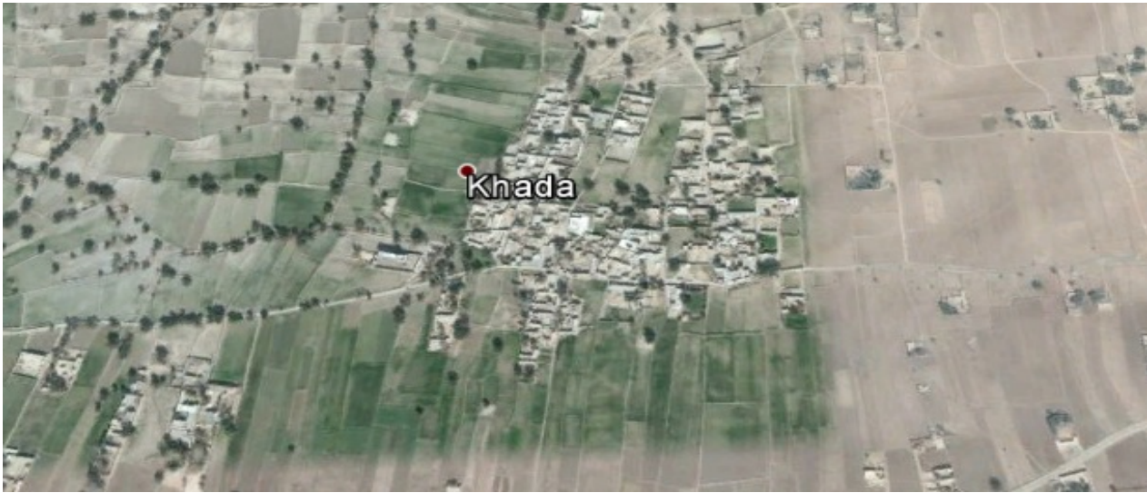
Fig 1: Map of Khada District Karak Khyber Pakhtunkhwa Pakistan.

preserve them and then set in to wooden boxes and labeled according to their systematic position. After the collection and preservation the specimens were identified up to species level by available literature, already existing specimens in the museum and keys [7].