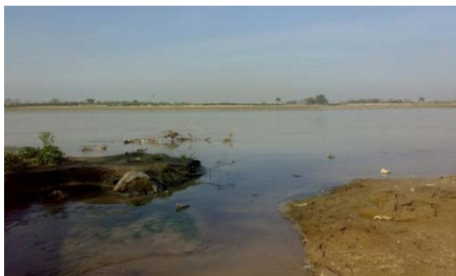
Fig 1: Effluent discharges of Cantt area Nowshera to River Kabul KP, Pakistan.