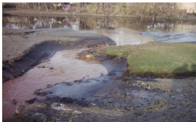
Fig 1: Khazana Sugar Mill Peshawar discharges KP, Pakistan.