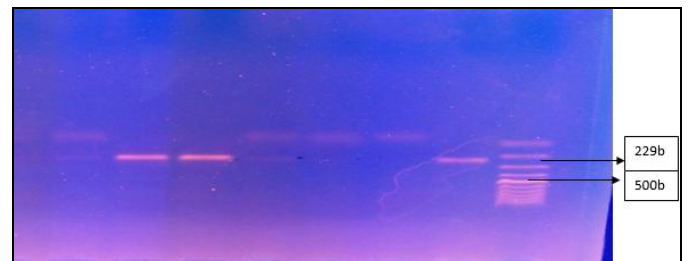
Fig 2: Results of faecal IS900 PCR (Lane 1: 100 bp DNA ladder, Lane 2: positive control, 6 and 7: positive faecal sample, Lane 3, 4 and 5: negative faecal samples)

Of the 92 samples positive on faecal microscopy, 40 faecal samples (+3 and +4 positives in microscopy) were subjected to DNA isolation and amplification using IS900 PCR. A total of 8 (20.0%) faecal samples were positive for MAP (Fig.2).