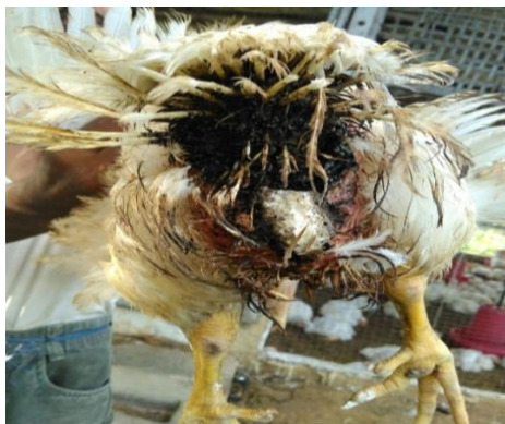
Fig 1: Vent infested with maggot

The prevalence of fly strike in relation to age has been depicted in Table 1. The study also revealed 0(0.00%), 21(1.05%), 45(1.99%) and 24(2.24%) birds infested with myiasis at the age of 4 th , 5 th , 6 th and 7 th week, respectively. The prevalence was nil in age group of 4 weeks. The \chi^2 test revealed significant difference ( p < 0.05 ) in prevalence rate of myiasis amongst the different age groups of broiler in the present study. A gradually increasing trend of prevalence rate towards the increasing of their age was observed as shown in Fig. 4. This might be due to the increasing of droppings in the litter material, negligence of the farmers, poor management of the litter materials, increase excessive moisture in and around the shed hence increase fly populations, increase requirement of the water but reduce management of the water trough etc. The prevalence and clinical manifestation of traumatic myiasis due to flies in geese flocks was reported by Farcas et al. [4] in Hungary. The prevalence myiasis in birds was not published in large scale from India but the prevalence of cutaneous myiasis was recorded as 53.00, 42.00, 4.00 and 1.00% in dogs, cattle, sheep and rabbits, respectively in Bangalore, Karnataka [3].