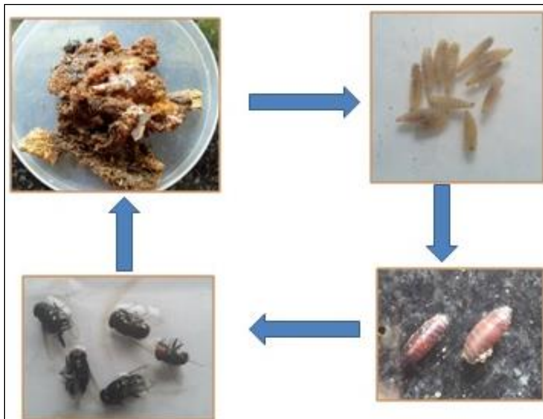
Fig 6: Life cycle of Chrysomya bezziana