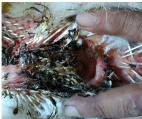
Fig 2: Droppings-soiled vent