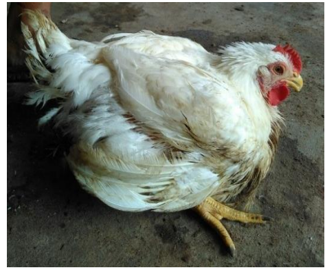
Fig 3: Clinical symptoms of fly strike in broiler

The prevalence of fly strike in relation to age has been depicted in Table 1. The study also revealed 0(0.00%), 21(1.05%), 45(1.99%) and 24(2.24%) birds infested with myiasis at the age of 4 th , 5 th , 6 th and 7 th week, respectively. The prevalence was nil in age group of 4 weeks. The \chi^2 test revealed significant difference ( p < 0.05 ) in prevalence rate of myiasis amongst the different age groups of broiler in the present study. A gradually increasing trend of prevalence rate towards the increasing of their age was observed as shown in Fig. 4. This might be due to the increasing of droppings in the litter material, negligence of the farmers, poor management of the litter materials, increase excessive moisture in and around the shed hence increase fly populations, increase requirement of the water but reduce management of the water trough etc. The prevalence and clinical manifestation of traumatic myiasis due to flies in geese flocks was reported by Farcas et al. [4] in Hungary. The prevalence myiasis in birds was not published in large scale from India but the prevalence of cutaneous myiasis was recorded as 53.00, 42.00, 4.00 and 1.00% in dogs, cattle, sheep and rabbits, respectively in Bangalore, Karnataka [3].