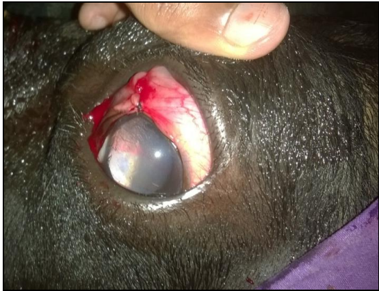
Fig 1h: Eye after Removal of Growth