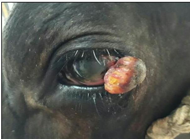
Fig 1A: Growth near the limbus of the left eye.