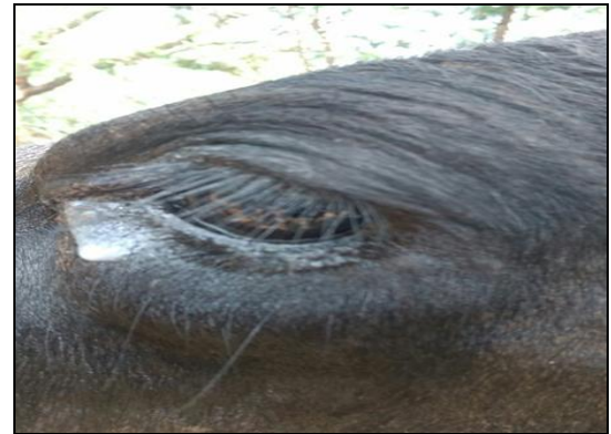
Fig 1D: Excision of neoplastic growth