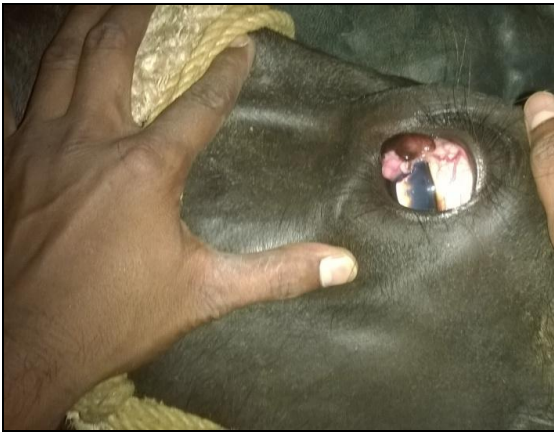
Fig 1g: Growth near Medial Canthus of Eye