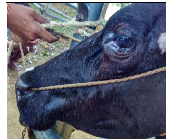
Fig 1f: Eye After Removal Of Growth