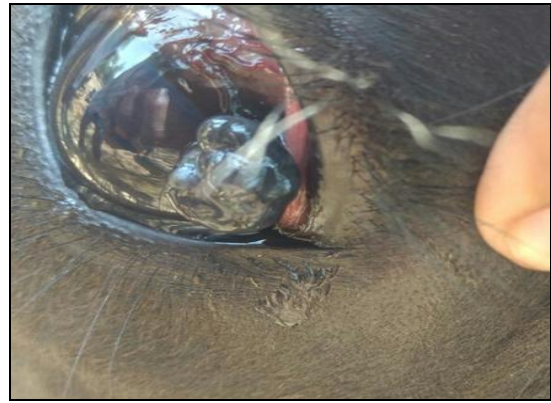
Fig 1C: Growth near the limbus of the left eye.

The authors wish to acknowledge the contributions of the staff of the Veterinary Hospital, Vinjamur.