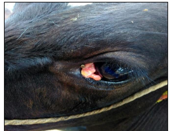
Fig 1E: Growth near medial canthus of eye