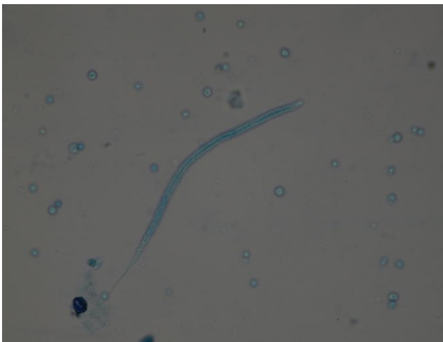
Fig 1: Microfilaria of Setaria spp. stained with Methylene blue revealing characteristic morphological features (10/40X)

Immature forms of Setaria spp. are found in the central nervous system of abnormal hosts such as sheep, goats and horses. Neurological disturbances have also been seen in cattle infected with Setaria spp. [8] which was observed in the present case. Microfilariae in the brain and spinal cord tissue from typical cases of bovine paraplegia in Mysore was reorded and considered the disease in cattle as cerebro-spinal nematodiasis [1]. Setarial microfilariosis in cattle and buffaloes has been successfully treated by several drugs namely Anthiomaline, Levamisole and Diethyl carbamazine citate. But appreciable results have been obtained with a single dose of Ivermectin and Doramectin at a dose rate of 200µg/kg BW SC [9]. With a single subcutaneous dose of ivermectin @ 200 µg/ kg body weight with oral haematinics administration for 5 days was successfully treated in a cattle affected with microfilariosis [7].