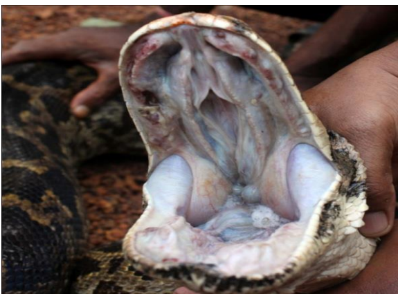
Fig 4: Fully healed oral lesions after completion of treatment

Infectious stomatitis has been reported in various species of reptiles with snakes being most commonly affected. The clinical signs associated with infectious stomatitis are often variable which include anorexia, excessive salivation, open mouth breathing, weight loss and caseous exudation from the oral cavity. Respiratory or GI infection may develop in poorly managed cases. Prolonged cases of infectious stomatitis can lead to systemic disease and possible death [5, 6]. The lining of the oral cavity may get eroded and often develops a "cottage cheese" appearance which is yellow or whitish-gray in colour. In severe cases, it appears like that mouth is rotting away, hence the name- mouth rot. In areas of deep ulceration and necrosis, a blood clot may form that is loaded with bacteria which when released into the bloodstream leads to septicemia [7].