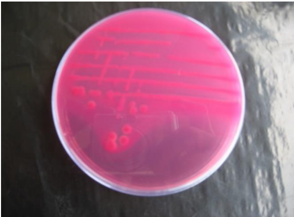
Fig 3: Pink colonies on Brilliant green agar