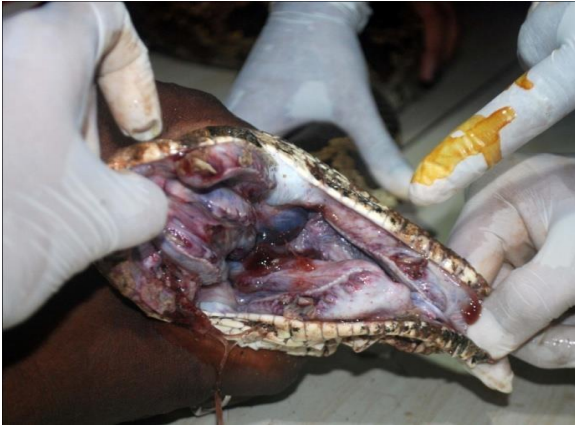
Fig 1: Mucopurulent discharge along with necrotic lesions in oral cavity