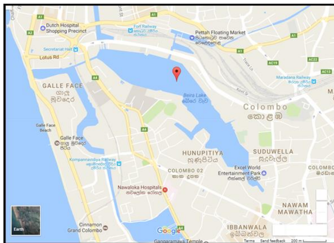
Fig 2: Location of Beira Lake

The toxins can be bio accumulated via aquatic food chains and affect top consumer levels containing vertebrates. Bio Accumulation Factor (BAF) is the quantification ratio between the biota and the environment at steady state equilibrium. It proves the idea to obtain the extent of risk assessed in order for safety precautions. Nevertheless, cyanotoxins have been a highlighted hypothesis for the prevalence of CKD (Chronic Kidney Disease) of unknown aetiology.