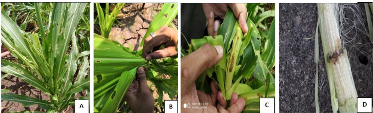
Fig 1: Different damage symptoms of S. frugiperda in maize field A. Ragged and elongated holes on leaves B. Shot hole symptoms on the outer leaves C. Larva feeding inside the whorl with fecal matter D. Larva feeding on the cob

Greyish brown male adults; forewings grey and brown shaded with oval or oblique orbital spots, triangular white patch near apical margins of the forewing (Fig. 2-J). In female adults, forewings lack distinct markings with uniform greyish brown mottled colouration [5, 6]. We had also received culture from Rajkot and Amreli districts of Gujarat and morphological features of larvae resembled with above mentioned distinct characteristics of S. frugiperda .