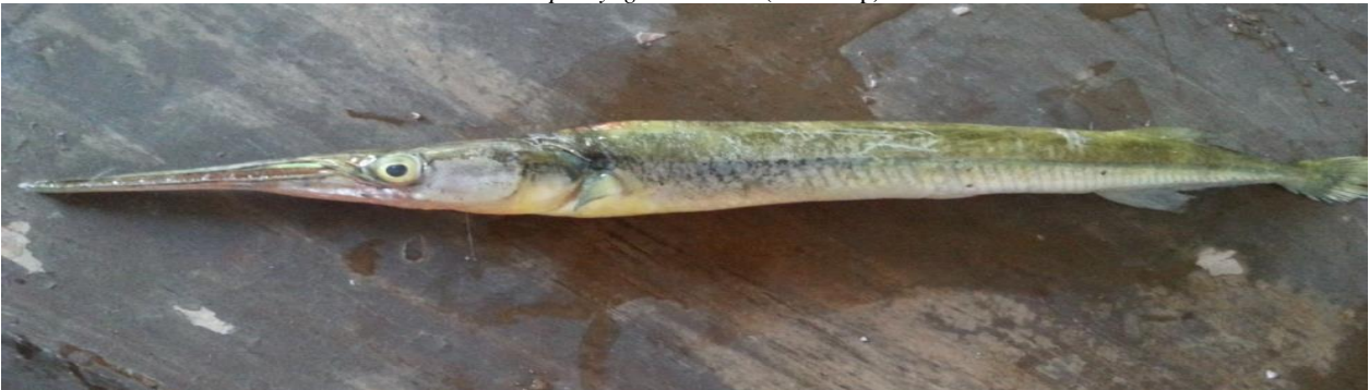
Xenentodon Cancila (Needle fish)