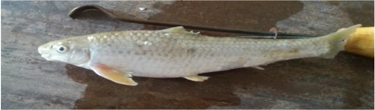
Ctenopharyngodon idella (Gras carp)