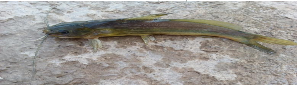
Glyptothorax cavia (Cat fish)