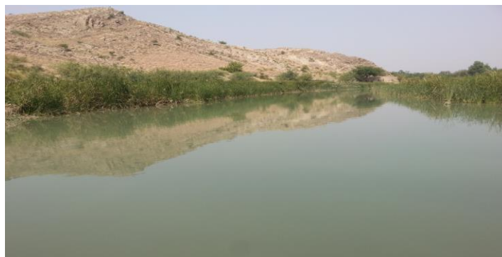
Fig 1: Short view of Bahawal Garh river district Kohat

Bahawal Garh river is situated near Dhoda Sharif towards the south at a distance of about one mile. Cultivators use this water for irrigation purposes. They irrigate their vegetables & cereal crops from this water. The water of this river is the combination of different canals, rain and springs therefore the water is not enough pure as compared to other dams in which the fishes live and grow fully (Figure 1).