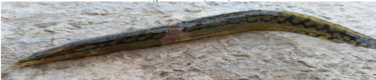
Mastacembelus armatus (Spiny eel)