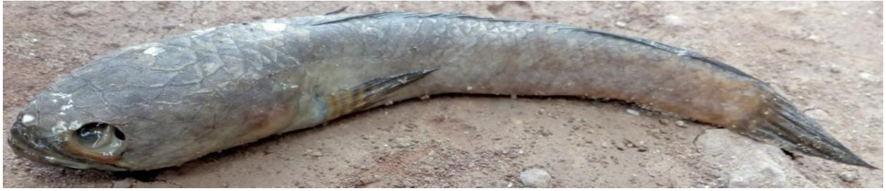
Labeodyocheilus pakistanicus (Boalla)