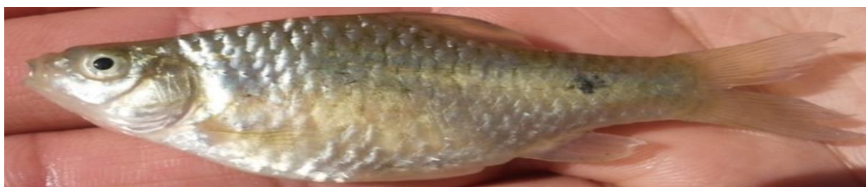
Pethiaconchoni (Rosy barb)