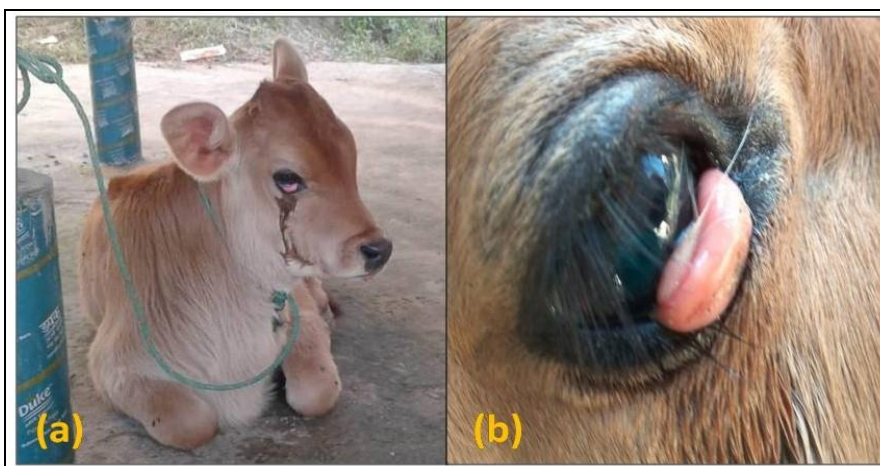
Fig 1 (a): Epiphora and blepharospasm of the right eye in the affected calf. Fig 1 (b): Dermoid mass with hairs on lower palpebral conjunctiva.