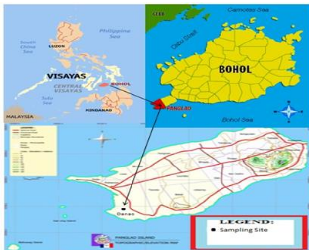
Fig 1: Map of the Philippines, Bohol and Panglao, with a dot indicating the sampling sites (Bohol Information Communication Technology Unit, 2011).

Barangay Danao, Panglao, Bohol is located at 9°34'44"N and 123°45' 00"E with a total land area of 789.65 hectares. It has an intertidal area of approximately 280,000 m 2 (1400m width x 200m length). In most of the littoral zone, dense sea grasses and some patches of algae were found.