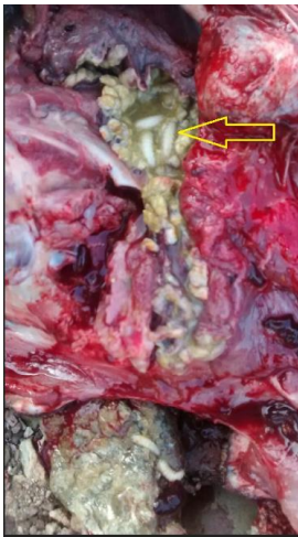
Fig 2: Oestrus ovis larvae in lungs.