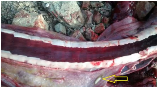
Fig 3: Oestrus ovis larvae in trachea.