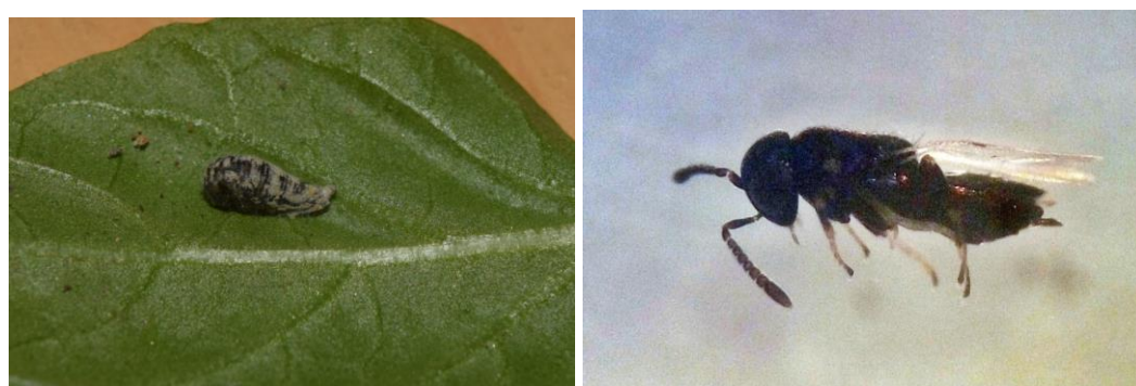
Plate 4: Pupa of hoverfly parasitized by Syrphophagus aeruginosus (Left); Adult Syrphophagus aeruginosus (Right)