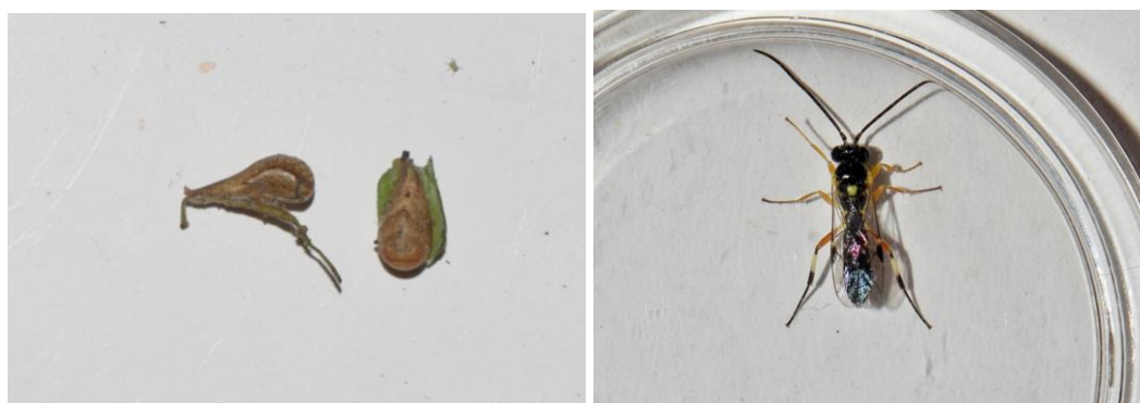
Plate 3: Pupa of hoverfly parasitized by Diplazon sp. (Left); Adult Diplazon wasp (Right)