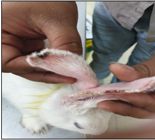
Fig 1: Picture showing severe dry crusty