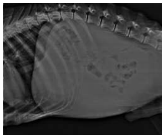
Fig 1: Left lateral radiograph of the abdomen showing hemoabdomen