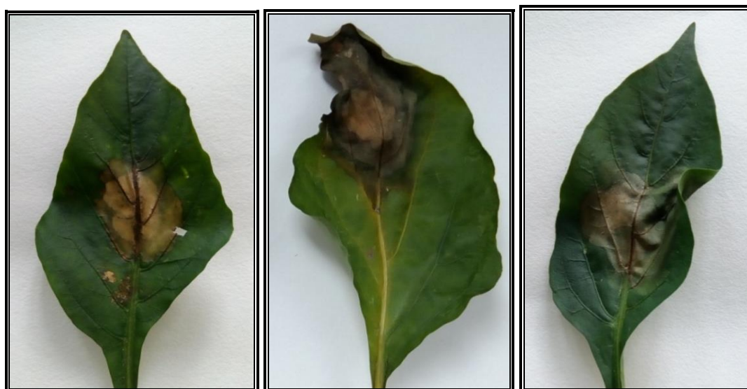
Plate 1: Zoospore release of P. capsici (A, B); Screening of capsicum lines for Phytophthora leaf