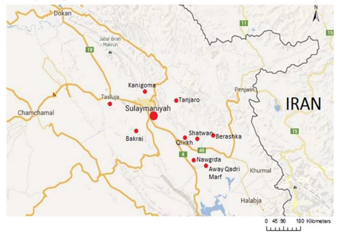
Fig 1: Locations of the sites for collection of samples in Sulaimaniya province.