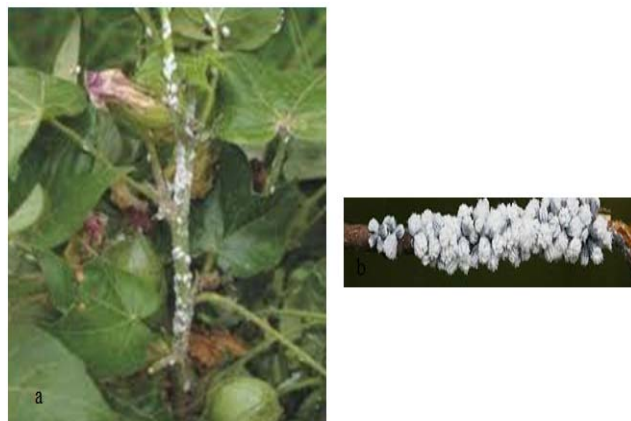
Fig. 3 Damaged plants of cotton crop a. moderate damage in field observation b. cotton twig having CMB population brought in lab for counting.

Department of Zoology, Faculty of Science, University of Sindh, Jamshoro and numbers of adult mealybugs were counted from entire twig as in Figure 3.