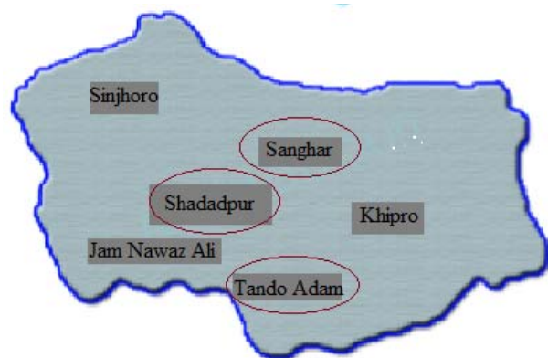
Fig. 1 Map of district Sanghar, showing location for sampling from three different taluka.

The cotton crop was surveyed from June to October, 2006-07 to observe the infestation of P. solenopsis in three different taluka of district Sanghar (Sindh) Pakistan. The selected locations for surveying are shown in Fig.1 and from each location one progressive cotton grower's farm was selected. Each cotton field was visited at fortnightly interval from sowing till harvesting. The sampling area of 0.5 acre was selected which further divided into five sites including four corners and centre as mentioned in Fig. 2